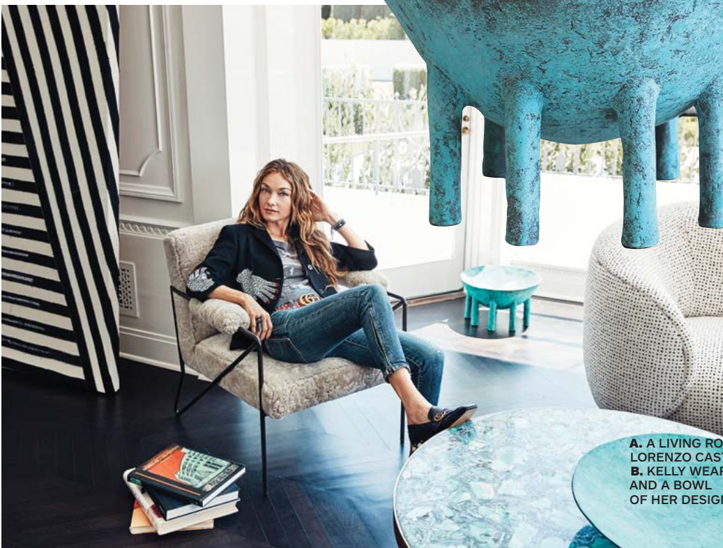
A. A LIVING ROOM BY LORENZO CASTILLO. B. KELLY WEARSTLER, AND A BOWL OF HER DESIGN.